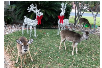
Can we Have Red Bows Too?

WEC will be sponsoring a photo contest for the City Celebration on September 29. Start Snapping pictures NOW! Contest Rules Will Follow at a Later Date!