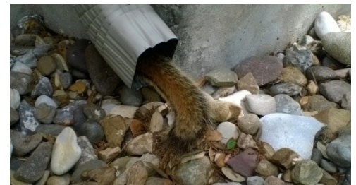
Can Squirrels Back Up?